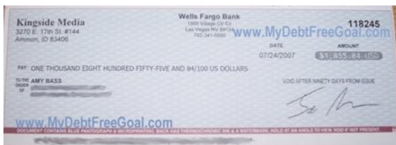
June check for $1,855.84

I haven't received my July earnings check yet or I would have it posted as well.