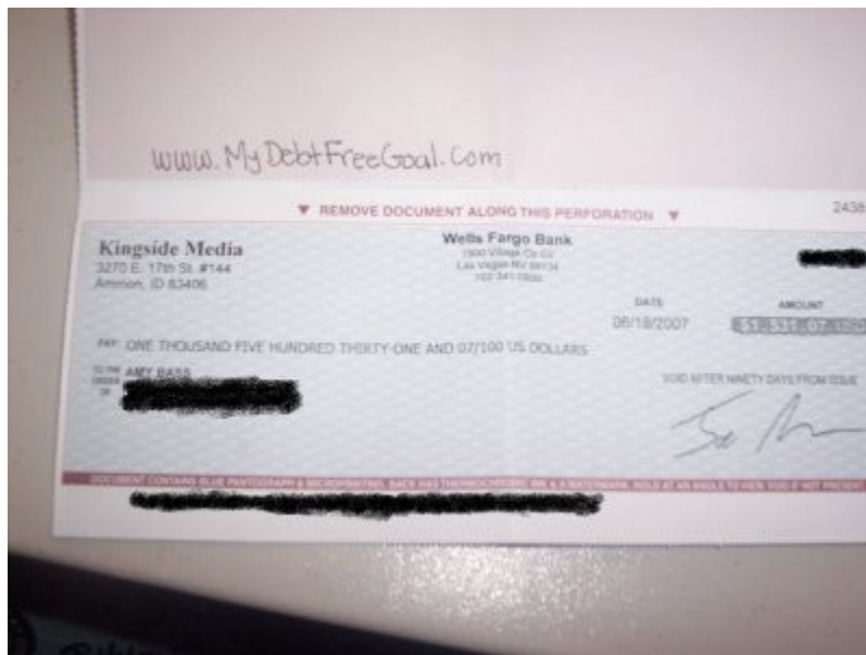
May check for $1,531.07

In fact, I didn't join any Get Paid To program until the middle of May so I actually made $1,500 my first two weeks.